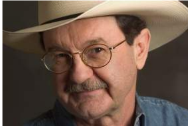
Jim Hightower, State Co-Chair

Editor, Hightower Lowdown & Former TX Agriculture Commissioner