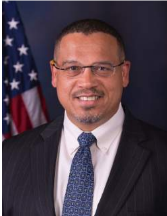
Keith Ellison, State Co-Chair MN Attorney General

Bio: Keith Ellison was elected Minnesota Attorney General in 2018 and represented Minnesotans in Congress from 2007-2009, where he championed consumer, worker, and civil rights protections to defend the rights of Minnesotans against the interests of the powerful. He passed laws to fight credit card abuse and to defend the rights of tenants and renters, and founded the Congressional Antitrust Caucus and the Congressional Consumer Justice Caucus. Before entering politics, Keith spent 16 years as an attorney specializing in civil rights and defense law, overseeing a team of attorneys focused on delivering justice for Minnesotans who had nowhere else to turn. For five of those years he also served as Executive Director of the Legal Rights Center.