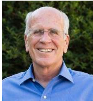
Peter Welch, State Co-Chair U.S. Representative (At-Large)

Bio: Patrick Leahy was elected to the United States Senate in 1974 and remains the only Democrat elected to this office from Vermont. At 34, he was the youngest U.S. Senator ever to be elected from the Green Mountain State. Leahy was born in Montpelier and grew up across from the State House. A graduate of Saint Michael's College in Colchester (1961), he received his Juris Doctor from Georgetown University Law Center (1964). He served for eight years as State's Attorney in Chittenden County where he gained a national reputation for his law enforcement activities and was selected as one of three outstanding prosecutors in the United States in 1974. Leahy is the Vice Chair of the Senate Appropriations Committee. He is the senior-most member of the Senate Judiciary Committee and of the Senate Agriculture Committee. Leahy is the Ranking Member of the Appropriations Subcommittee on State Department, Foreign Operations and Related Programs. He ranks first in seniority in the Senate.