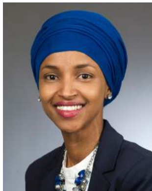
Ilhan Omar, State Co-Chair U.S. Representative (CD-5)

Statement: “The most pressing problem of our time is inequality. For working-class people, they really can’t thrive and grow in this economy and Bernie has the best prescriptions now. Over the course of time he has demonstrated the most consistent commitment to working families.”