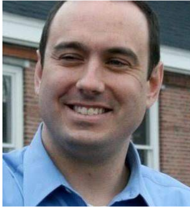
Jamie Eldridge, State Co-Chair State Senator (Middlesex & Worcester District)

Bio: State Senator Jamie Eldridge represents the 14 communities of the Middlesex and Worcester district. He serves as a leader with the Senate Progressive Caucus, co-chairs the Criminal Justice Reform and Clean Energy Caucuses, and is the author of An Act to Establish Medicare for All in Massachusetts, 100% Renewable Energy, the Safe Communities Act to protect immigrants, Debt-Free College, and legislation to close corporate tax loopholes. He serves as the Senate Chair of the Joint Committee on Judiciary and is the only legislator to be elected under the publicly-financed Clean Elections law in Massachusetts history. He was a national delegate for Bernie Sanders for the 2016 DNC Convention, and a national delegate for Barack Obama for the 2008 DNC Convention.