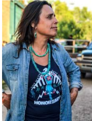
Winona LaDuke, State Vice-Chair Co-Founder, Honor the Earth

Bio: Winona LaDuke is a rural development economist and author, who works on issues of Indigenous economics, food, and energy policy. She co-founded Honor the Earth with the Indigo Girls, as a platform to raise awareness of and money for Indigenous struggles for environmental justice. Globally and nationally, Winona is known as a leader on the issues of culturally-based sustainable development strategies, renewable energy, and sustainable food systems. She is a leader in efforts to protect Indigenous plants and heritage foods from patenting and genetic engineering.