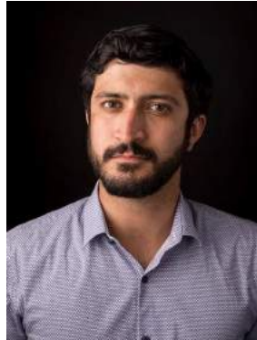
Greg Casar, State Co-Chair Austin City Council Member (District 4)

Bio: Gregorio "Greg" Casar is the son of Mexican immigrants, a labor and community organizer, and the youngest person ever elected to the Austin City Council. He has passed policies to disrupt mass incarceration and mass deportation, end inexcusable tax breaks for the wealthiest, and create an unprecedented expansion of funding for affordable housing. Casar was the sponsor of Austin's paid sick days law which the Austin American Statesman called "the most progressive local labor policy in Texas and the American South."